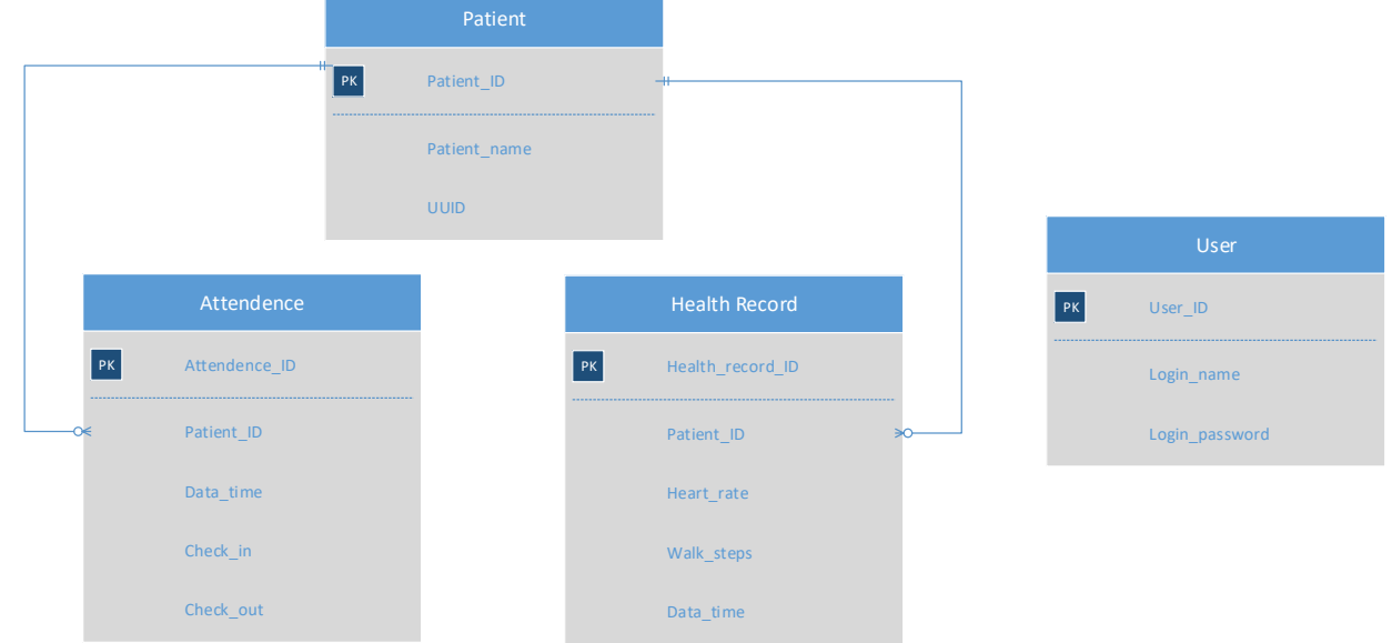
Fig. 3: System database schema.

There are total of four tables in the database (Fig. 3): 'Patient', 'Attendance', 'Health Record', and 'User'. The 'Patient' table has three attributes that save the patient ID, patient's name, and UUID of her or his K18 smart bracelet. The 'Attendance' table has five attributes that save attendance ID, patient ID, date and time of attendance, and check in/out information. The 'Health Record' table has five attributes that save health record ID, patient ID, heart rate, and step count of a patient with this patient ID at a certain date and time. The 'User' table has three attributes that save user ID, and user login name, and password to allow center staff to log into the system. There is a relationship between the patient table and attendance table, and another between the patient table and health record table. Both use the patient ID as a foreign key to link to each other.