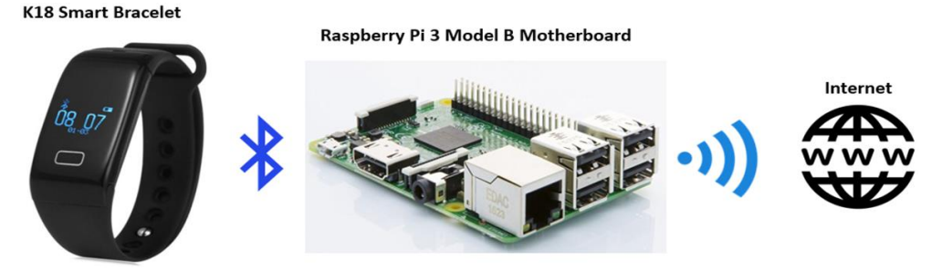
Fig. 2: Wearable device and gateway.

We also used a Raspberry Pi 3 Model B Motherboard (RP3B) mini computer as the system's gateway. RP3B has Bluetooth 4.0 and scans UUIDs to provide user attendance data to the operator. As shown in Fig. 2, the RP3B supports a connection between the wearable device and the Internet. RP3B's Bluetooth can communicate with the wearable device, and its network card can send the data into Internet via WiFi or Ethernet cable. The RP3B is also low in cost (around $30).