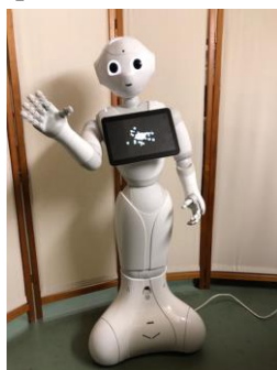
Fig. 1: Waving posture of Pepper robot.

Pepper robot, released from Softbank Robotics, is very popular in these kinds of human robot interaction applications. Initially it was particularly designed for an application of business uses in Softbank stores, it becomes a platform of interest for various other applications including academics and home-entertainment areas. Pepper robot was designed by these principles: pleasant appearance, safety, interactivity, affordability and good autonomy [2]. Pepper robot has a smart appearance with its humanoid upper body, operated with amazing functionalities such as emotion perception, speaking with gestures and omnidirectional movement provided by the wheeled base. It can interact with humans through speech, and if the customer requests some information, it can also give answer by either speech feedback, or visual feedback using a tablet [1].